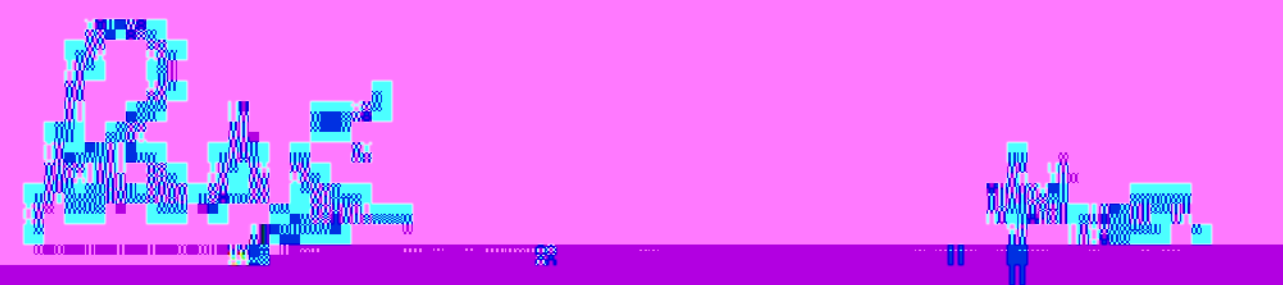
Figure 1. Facilitator Feedback

Very Satisfied Satisfied Neutral Dissatisfied Very Dissatisfied